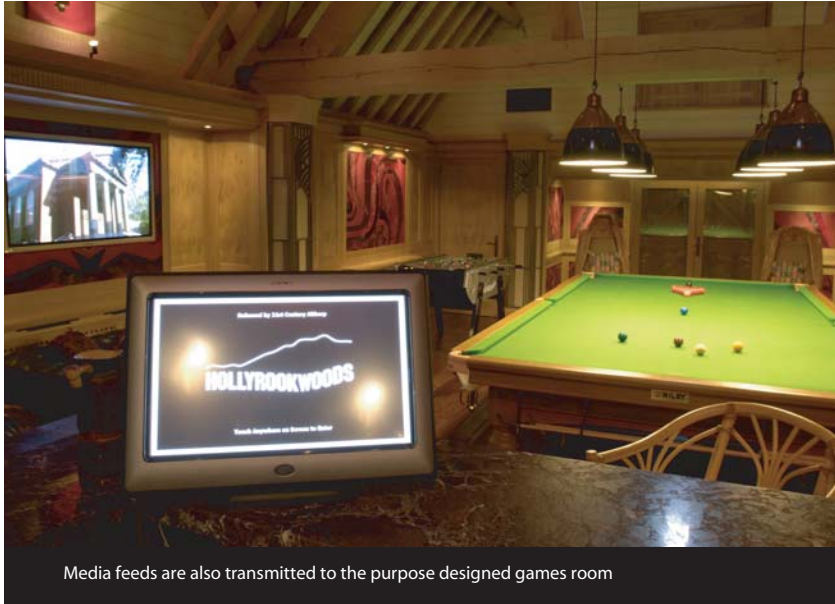
Media feeds are also transmitted to the purpose designed games room