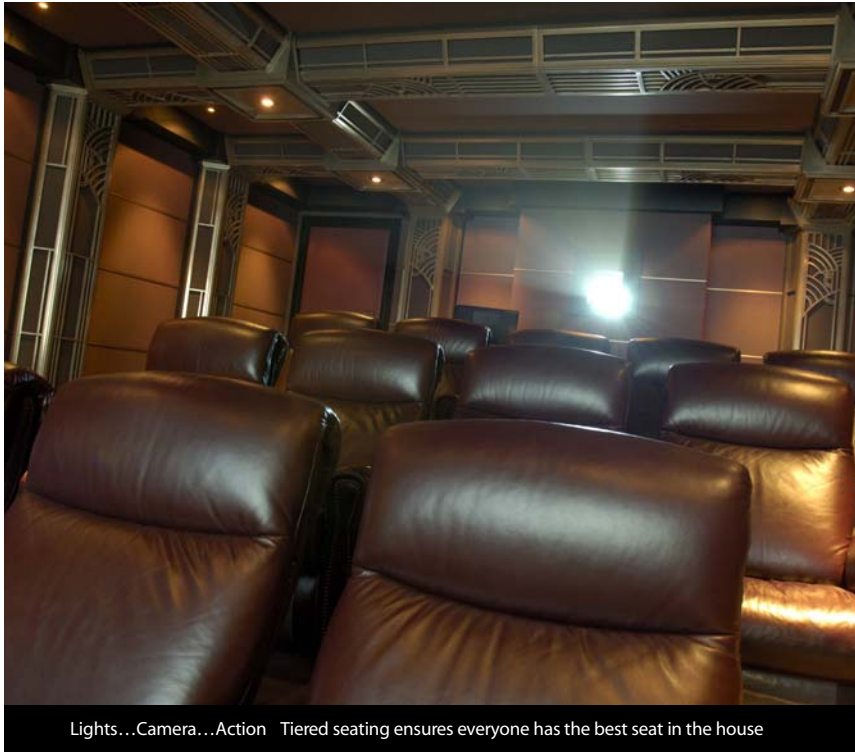
Lights...Camera...Action Tiered seating ensures everyone has the best seat in the house

In addition, the panel controls the Lutron lighting system, air-conditioning, heating and a top-of-the-range 'Stewart' film screen and curtains, which automatically adjust to frame the picture format; from 4:3 television ratio to widescreen cinema formats.