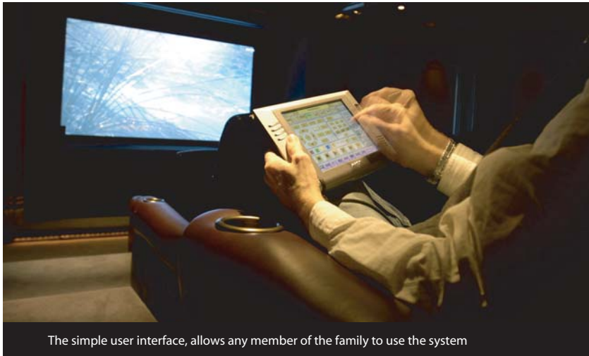
The simple user interface, allows any member of the family to use the system

any of the multiple sources housed in the equipment room. The touch panel signals are transmitted to the individual devices via an AMX Netlinx controller, which is able to communicate with each device linked to the system.